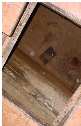
Well pit in den of home.