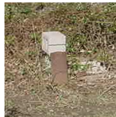
Abandoned well with no cap.