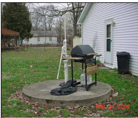
Hand pump well.

Examples of wells may be seen below in Figure 1: